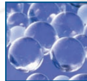
Precision glass balls