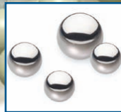
Chrome steel balls